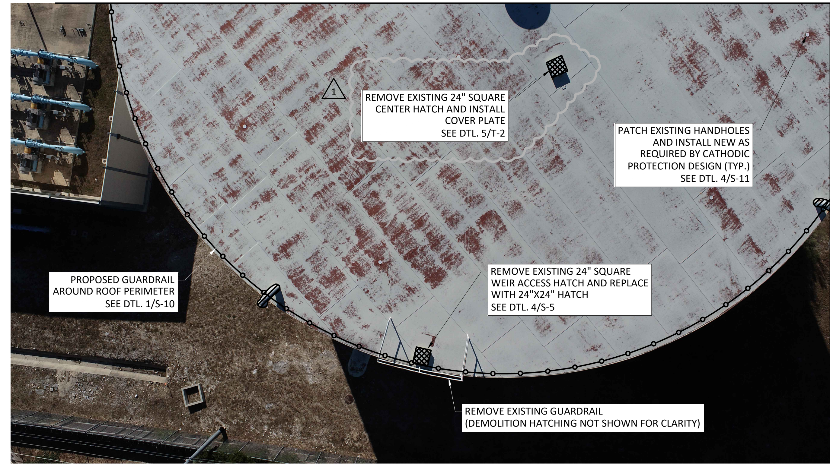
2 T-1 TANK AERIAL NTS