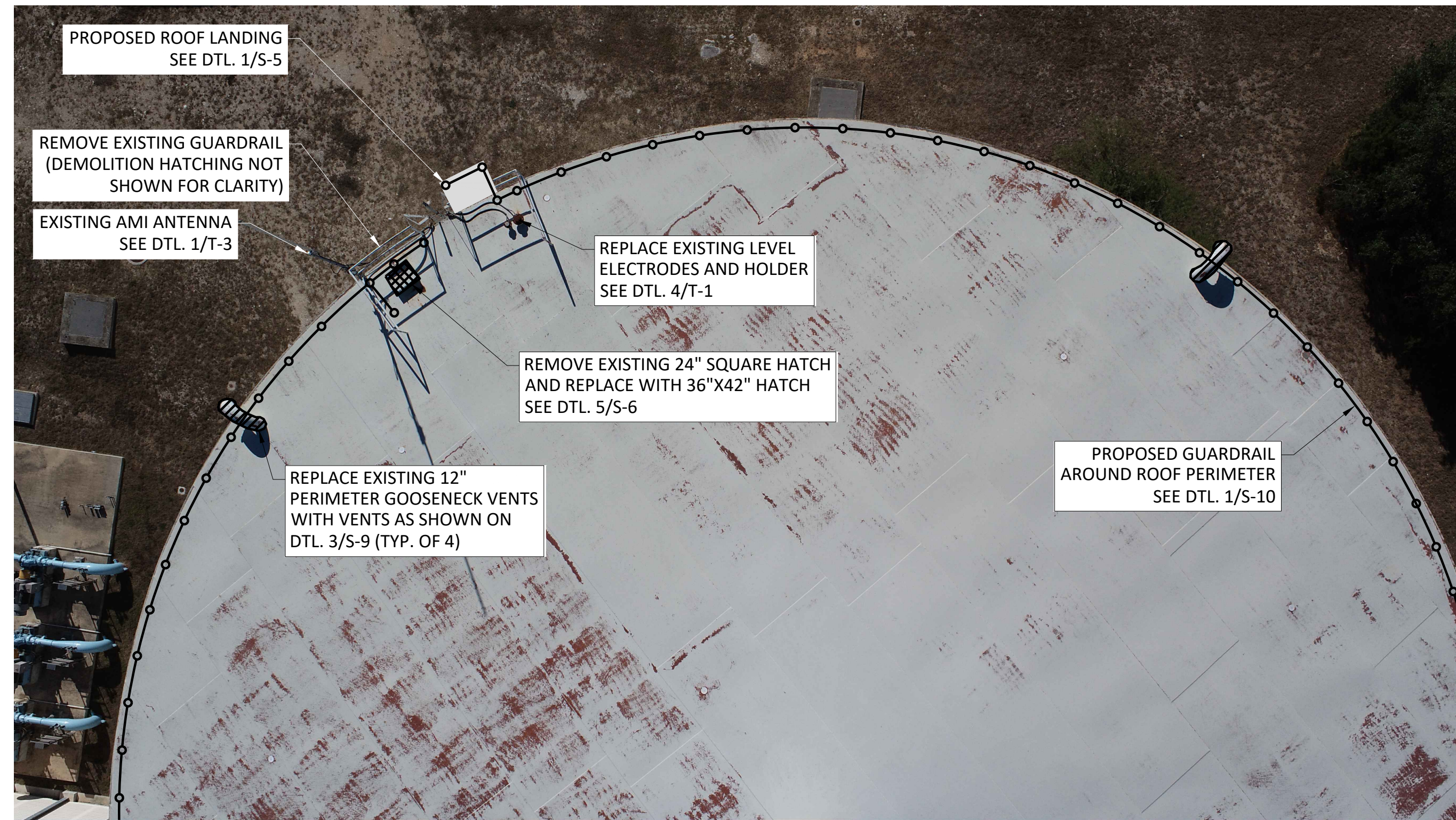
1 T-1 TANK AERIAL NTS