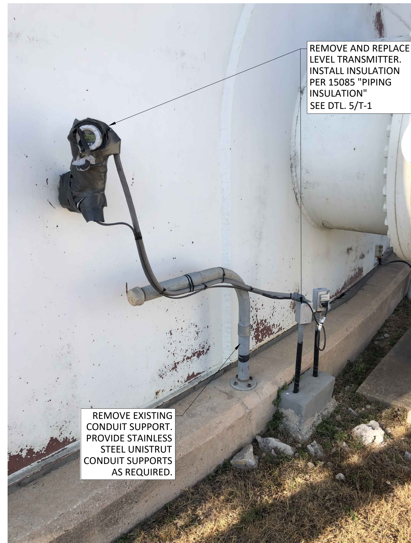
3 T-1 LEVEL TRANSMITTER NTS