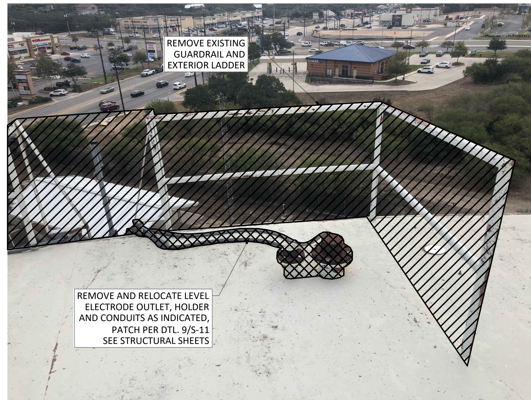
4 T-1 FLANGED OUTLETS NTS